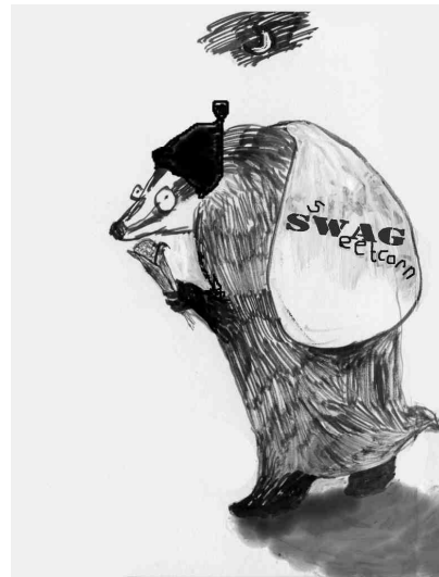
Illustration by Holly Ambrose